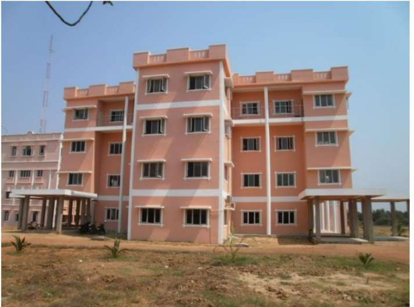
BASIC ENGINEERING BLOCK