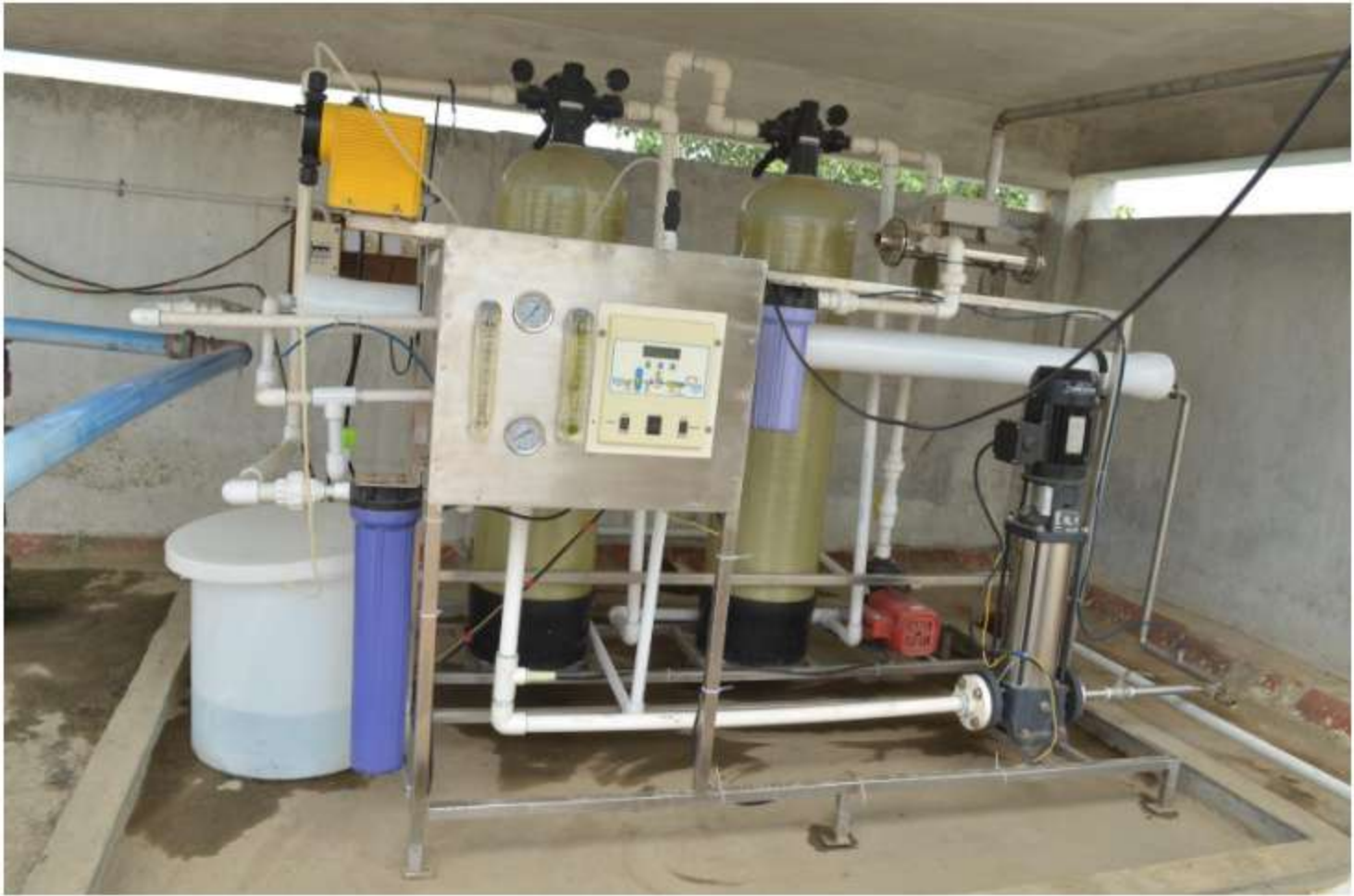
RO WATER PLANT