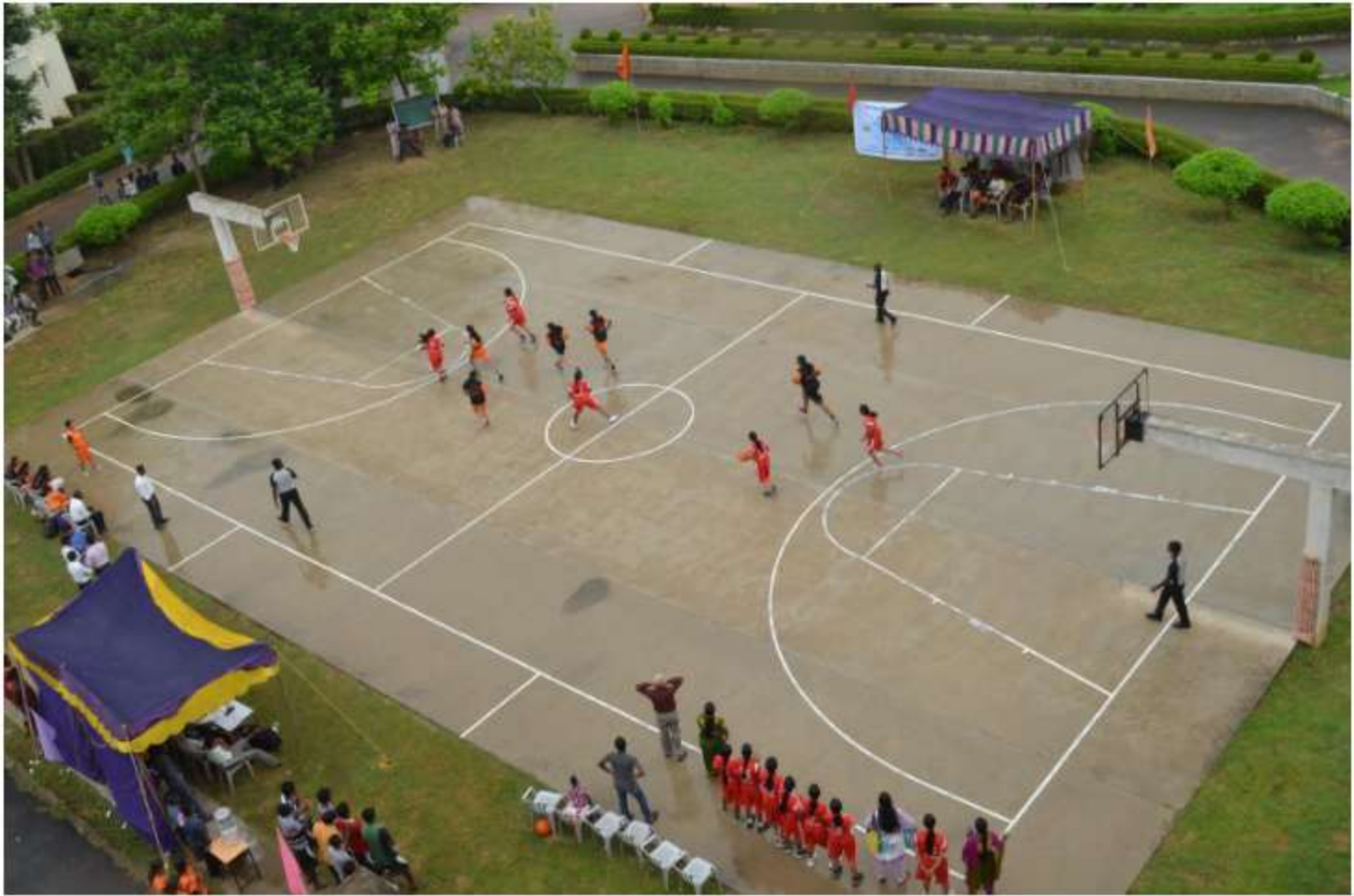
BASKET BALL GROUND