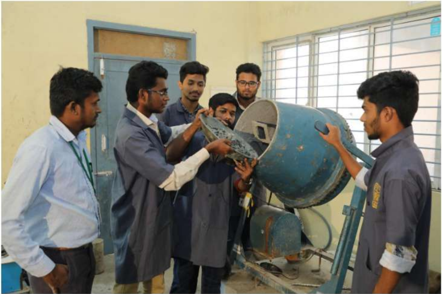
CONSTRUCTION MATERIALS LAB