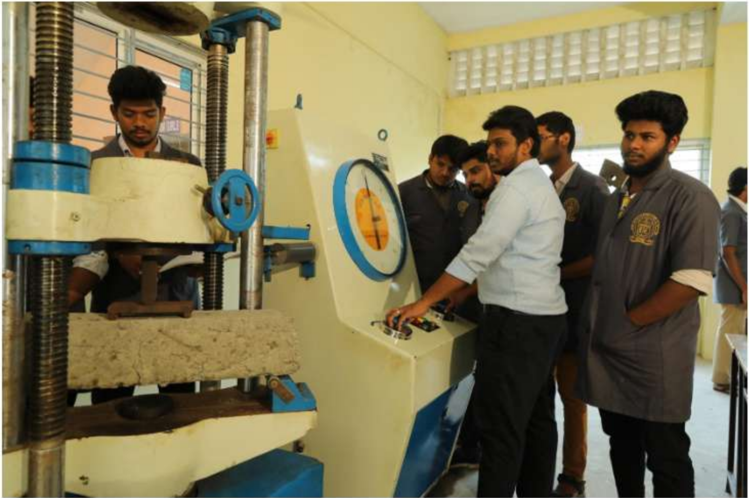
STRENGTH OF MATERIALS LAB