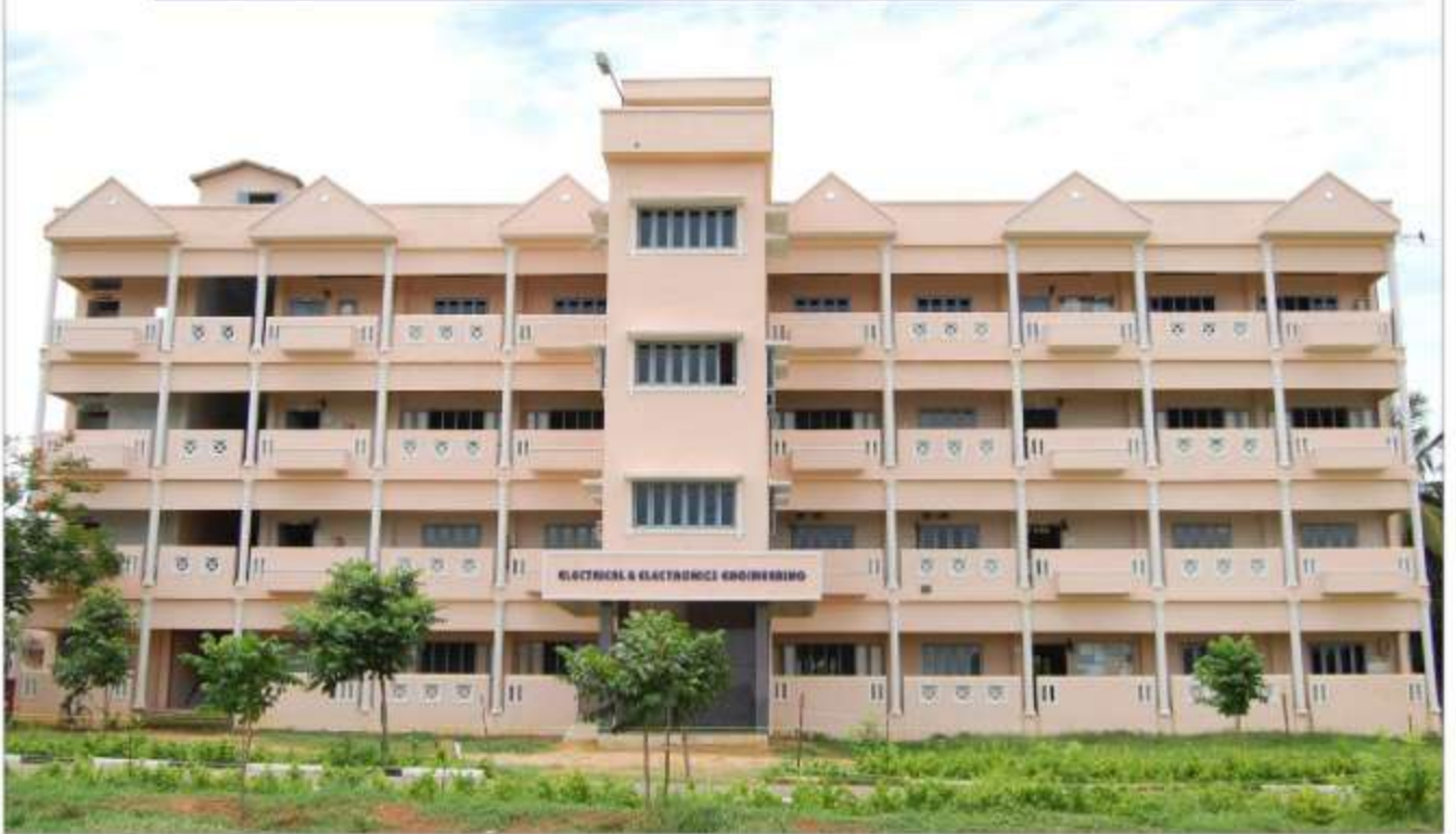
Electrical and Electronics Engineering Block