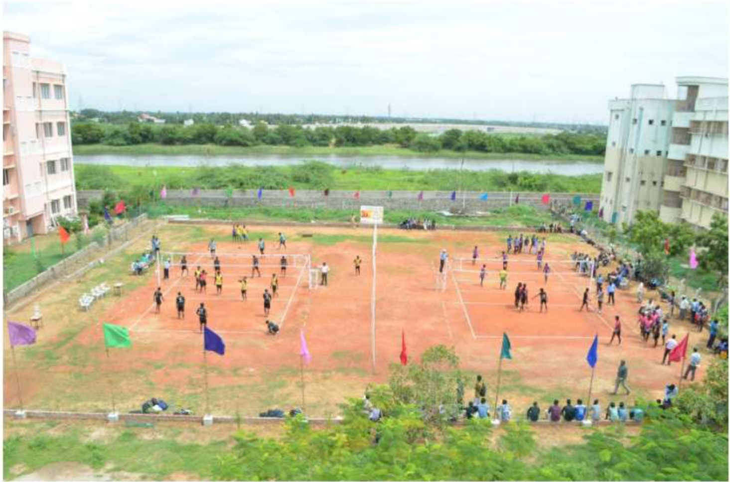
Volley Ball Play Ground