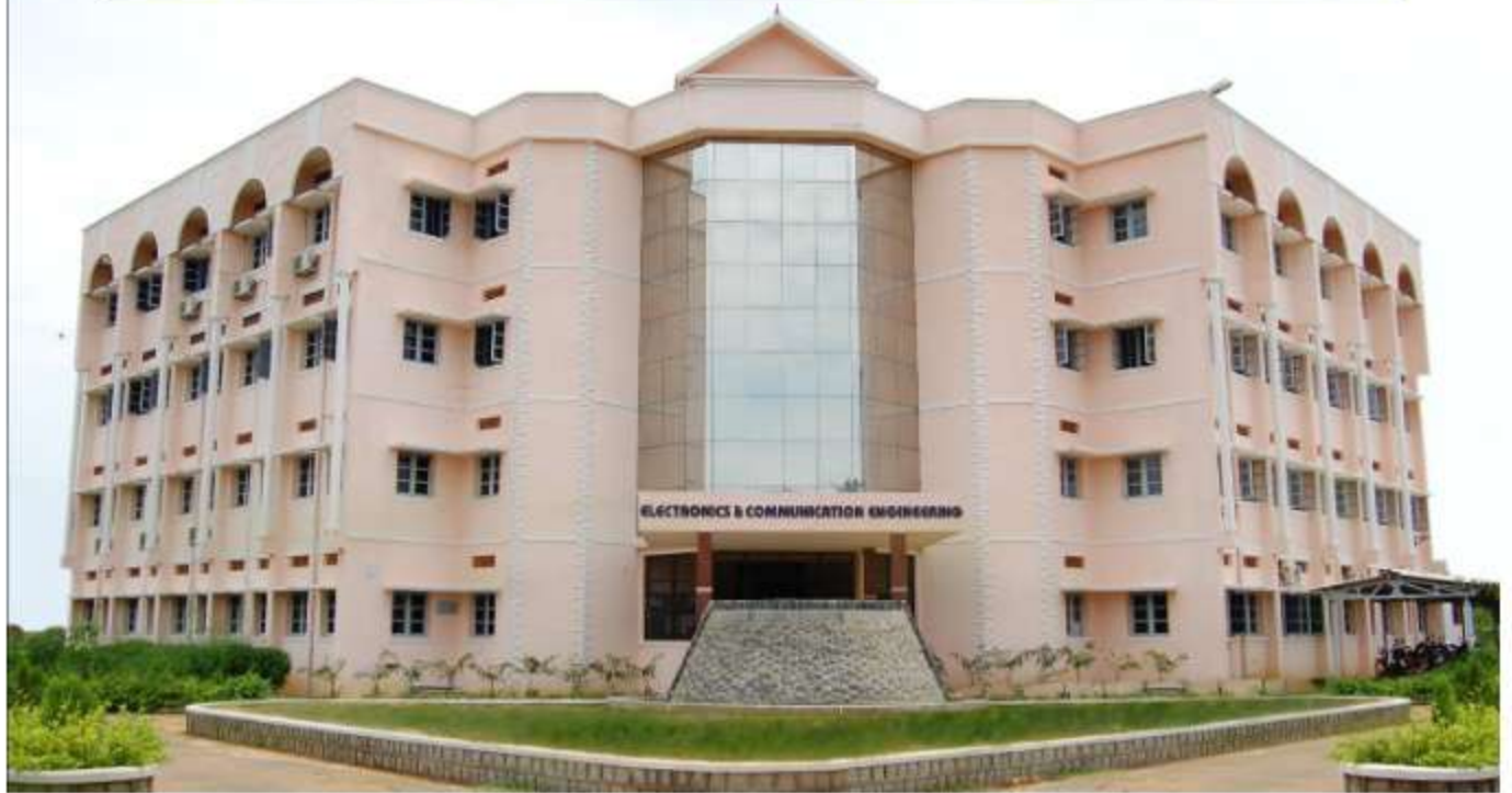
ELECTRONICS AND COMMUNICATION ENGINEERING BLOCK