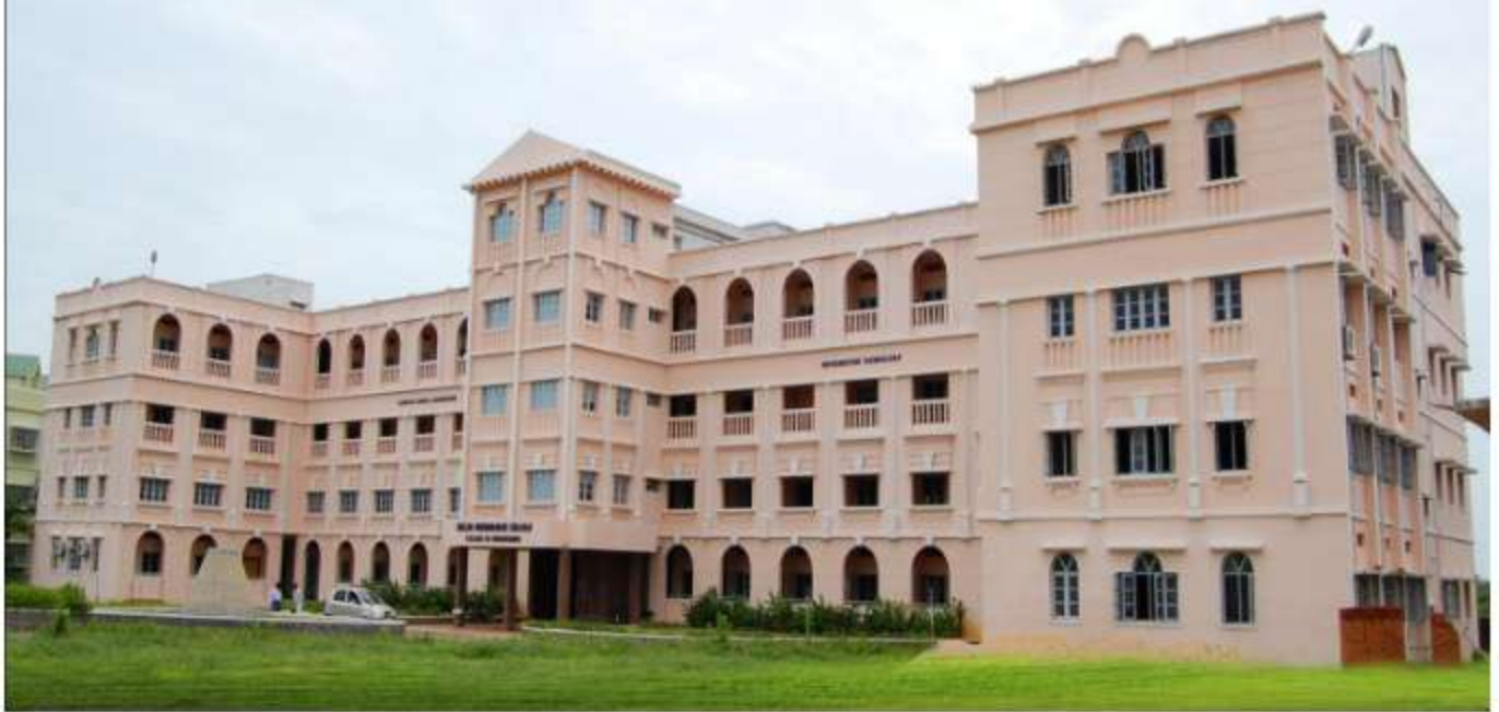
COMPUTER SCIENCE AND INFORMATION TECHNOLOGY BLOCK