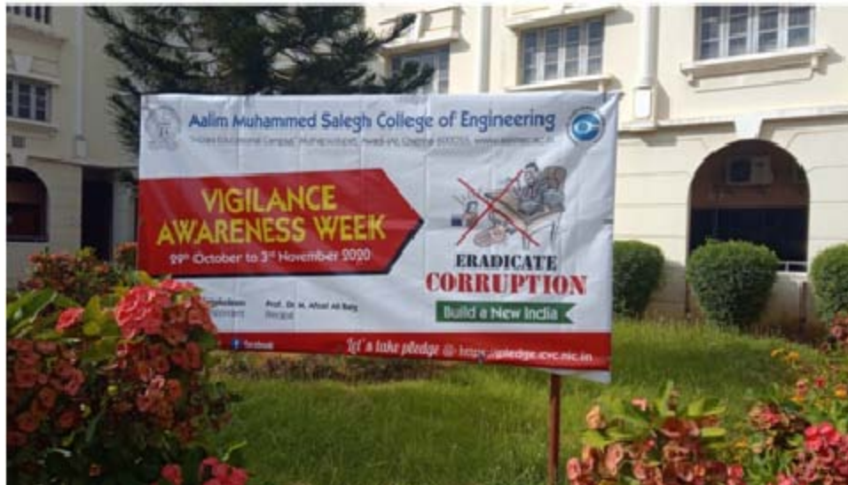
Vigilance awareness week poster in college premises

Vigilance awareness week is conducted on 29 th October to 3 rd of November 2020 in the college campus and integrity Pledge has been taken by the 964 students and 15 faculty members.